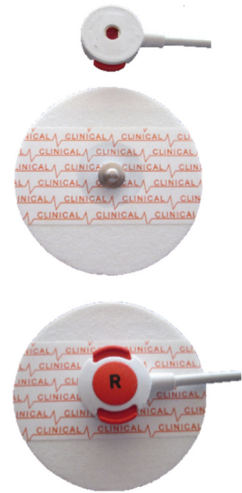
Example of use